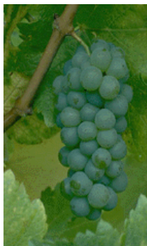
The Concord grape was developed in 1849 in Concord, Massachusetts. This grape is the top choice for grape jelly and Kosher wine.